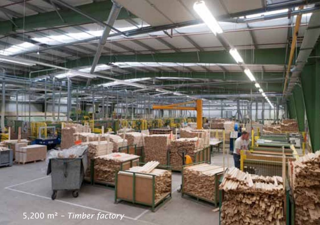
5,200 m 2 - Timber factory