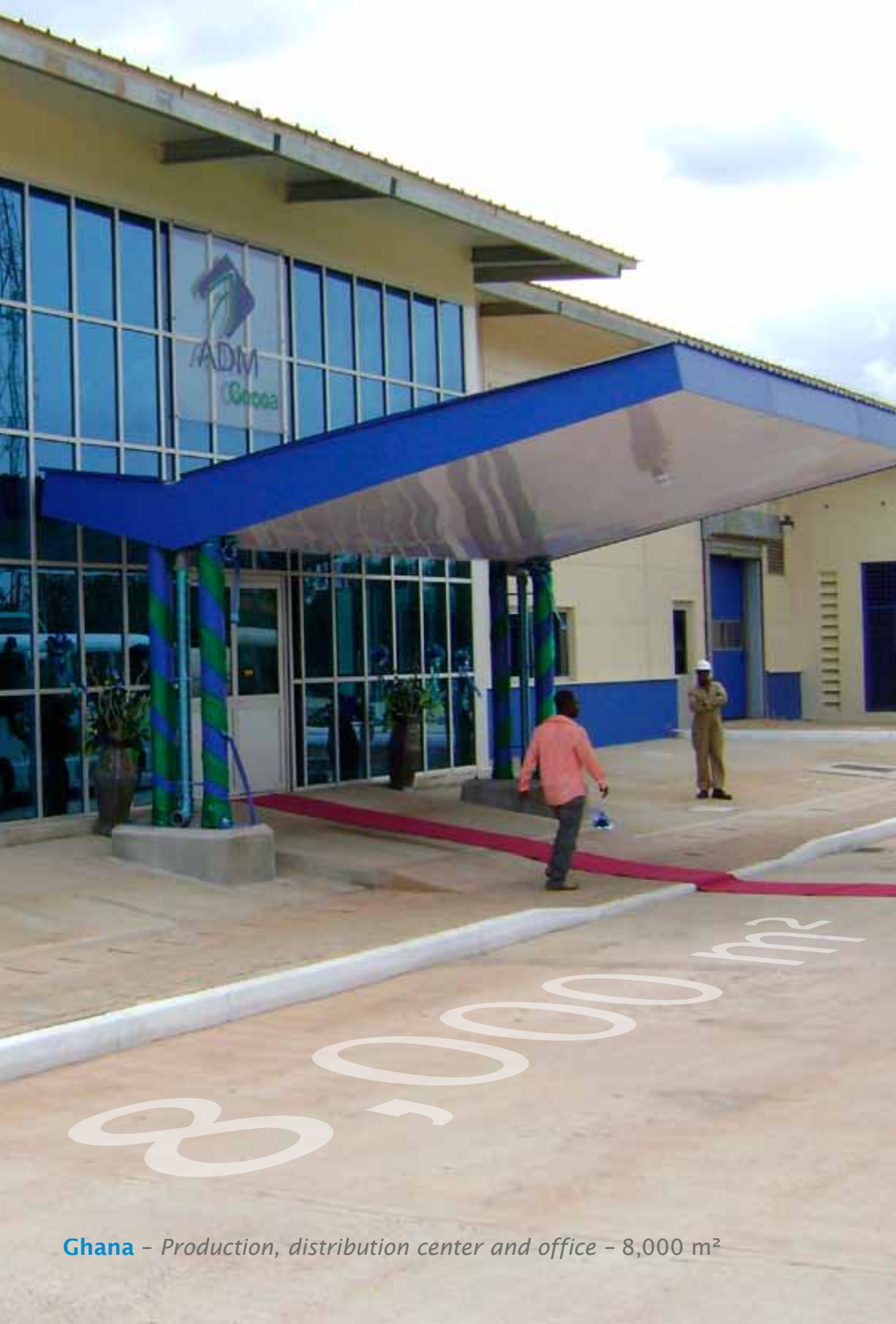
Ghana – Production, distribution center and office – 8,000 m 2

Thinking outside the box is what sets BOTEC apart, shifting boundaries in building solutions and crossing borders as a company. The BOTEC team has over 20 years of experience in Central and Eastern Europe, 16 of which were gained in Romania. As well as Europe, we have also executed projects in Latin America and Africa. Thanks to an international partner network and local support, BOTEC guarantees the same levels of quality everywhere.